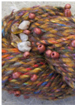
brown / gold