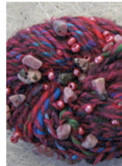
wine / wine