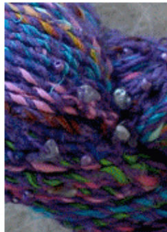
purple / purple