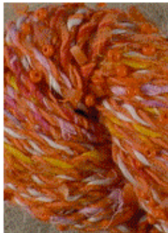
orange / tangerine