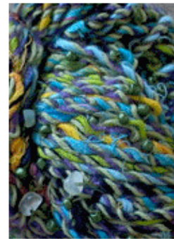
lime / purple