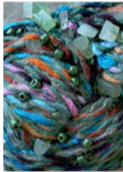
jade / sage